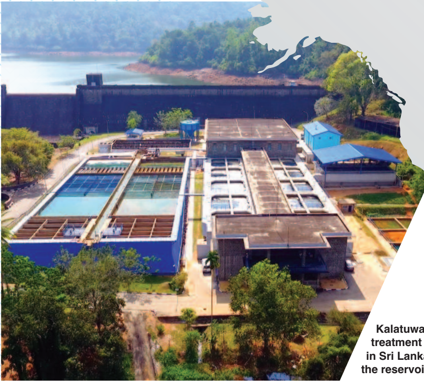
Kalatuwawa water treatment plant in Sri Lanka with the reservoir