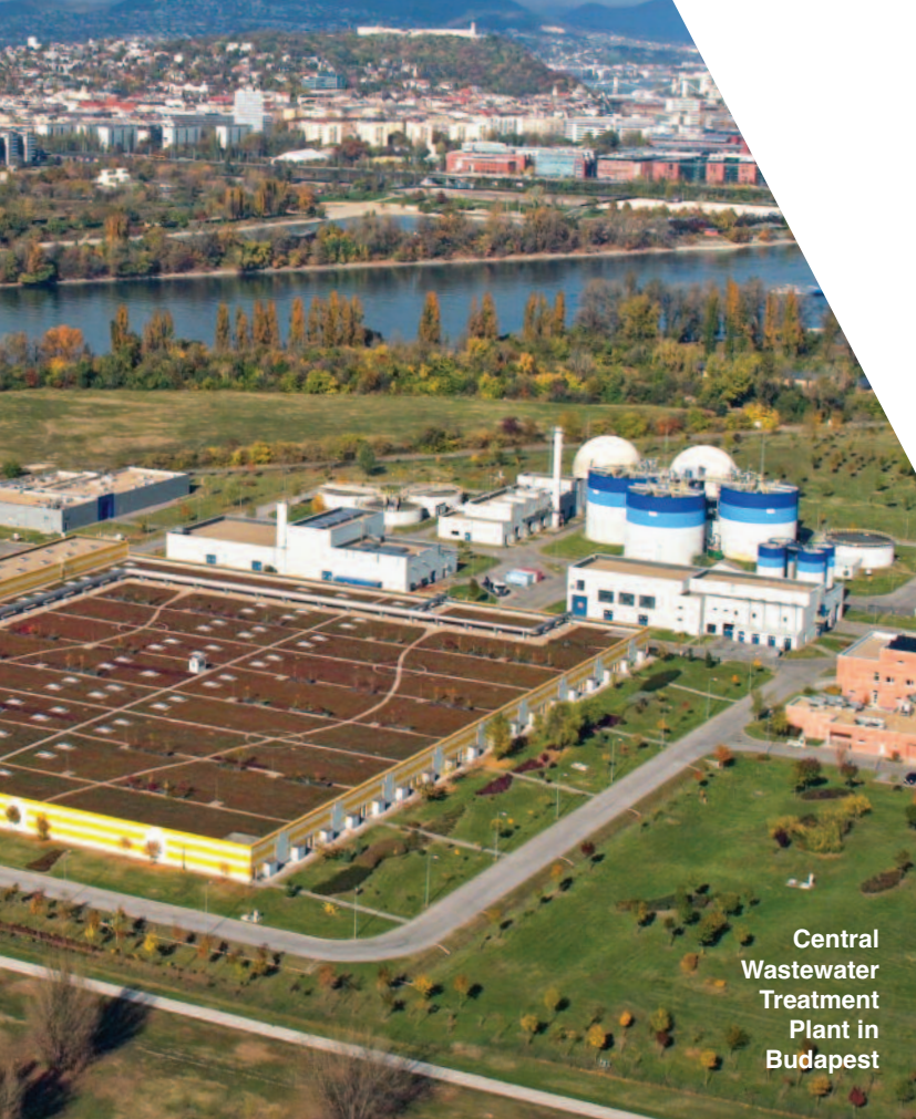
Central Wastewater Treatment Plant in Budapest