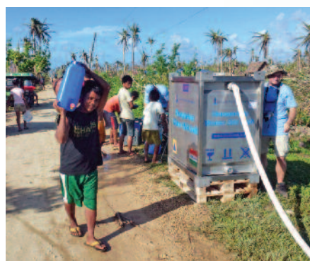
← Mobile water purification, Philippines

They can produce and package potable water from any water source of any contamination level, thanks to the engineering expertise and technology incorporated into them, which is unique in world comparison.