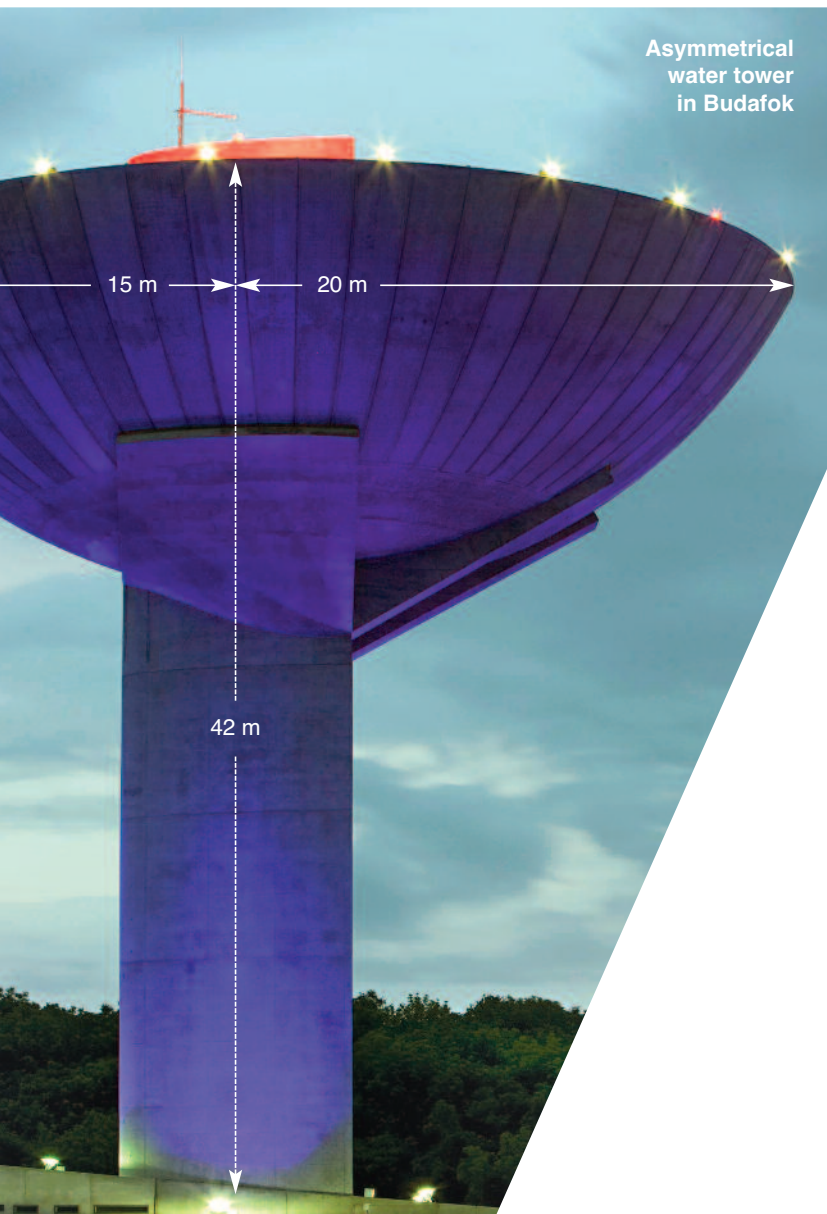
Asymmetrical water tower in Budafok