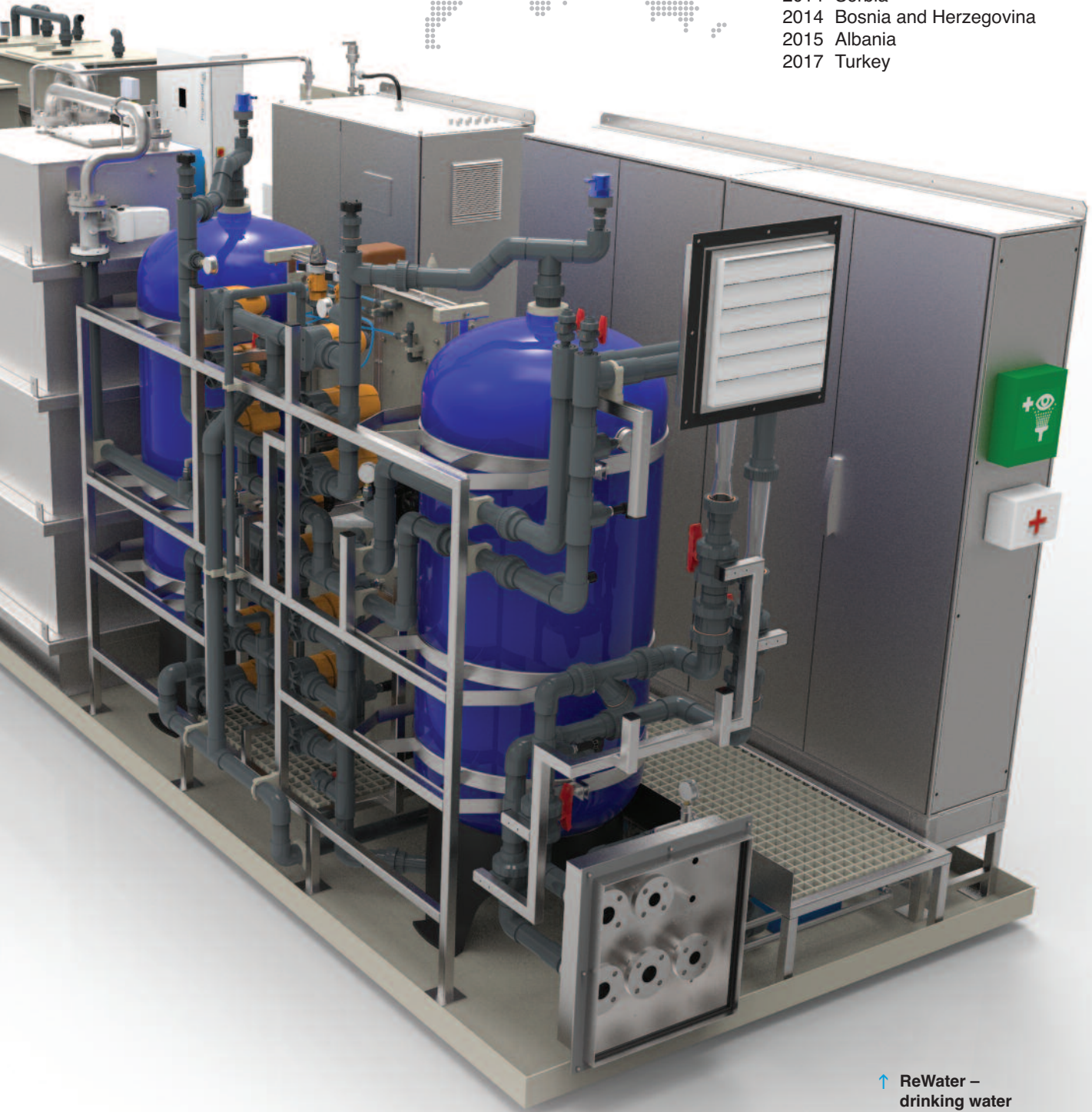
↑ ReWater – drinking water from wastewater