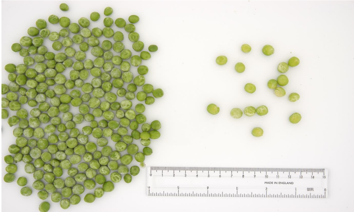
The product does not contain mow-burnt peas Figure 7.: