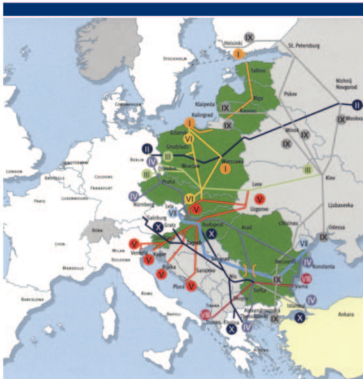
Map of Pan-European transport corridors

Dresden – Prague – Bratislava – Dyord – Budapest – Arad – Krayova – Sofia – Plovdiv – Istanbul, with branching to Sofia – Kulata – Thessaloniki, is the road linking the Central European countries with the Aegean Sea (Port Thessaloniki). The ETC lot on the territory of Bulgaria (Vidin – Sofia – "Kulata" border crossing point) is 446 km long.