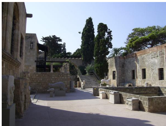
Archeological Museum Rhodes

LAUNCHING (G)LOCAL LEVEL HERITAGE ENTREPRENEURSHIP: STRATEGIES AND TOOLS TO UNITE FORCES, SAFEGUARD THE PLACE, MOBILIZE CULTURAL VALUES, DELIVER THE EXPERIENCE