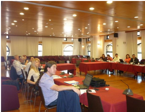
Kick off Meeting

The first Kick off Meeting day was devoted to the project activities, calendar of events and review of the financial structure of the project. The communication plan was presented. At the end of the meeting we had open debate.