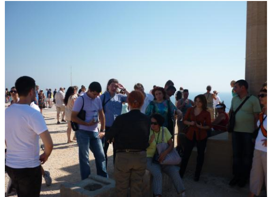
Visit of Acropolis of Lindor

We continued the study visit in the old town of Rhodes, with gates and moat, the Grand Palace and Knight Street. Rhodes is the capital of the island of Rhodes. It was known since ancient times as the Colossus of Rhodes town, one of the Seven Wonders of the World. Rhodes Fortress, built by Hospitalliers, is one of the best preserved medieval cities in Europe, which was appointed a UNESCO World Heritage List in 1988. Rhodes Island and the town is a popular international tourist destination.