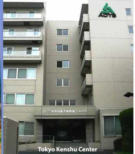
Tokyo Kenshu Center