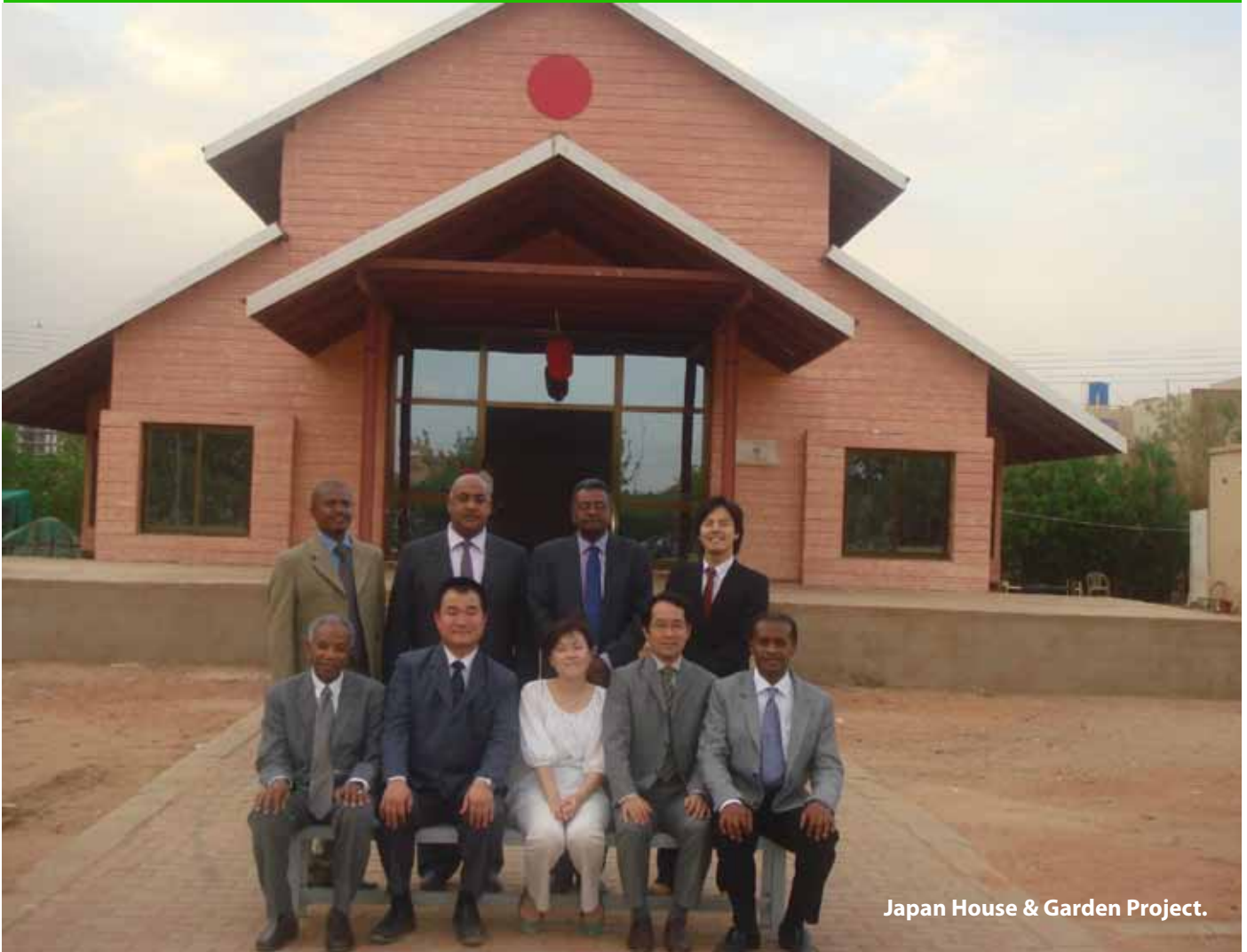
Japan House & Garden Project.