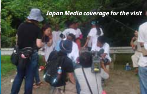
Japan Media coverage for the visit