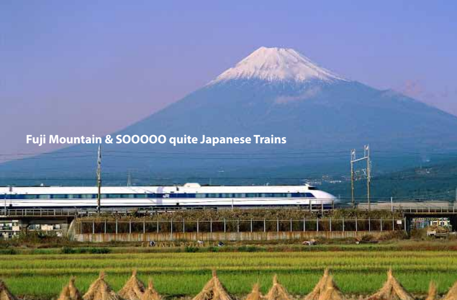
Fuji Mountain & SOOOOO quite Japanese Trains

During our stay in the Japan we had formal and informal travel to different places, the formal was part of the program and the informal was for fun to Fuji mountain, we were astonished by the behavior of the Japanese in the trains, the were soooooo quite no body was speaking and making jokes during the trip or laughing loudly as we use to do, even they are not showing disgust to our behavior. Yes it is a different culture