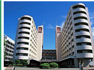
Accommodation & Seminar room