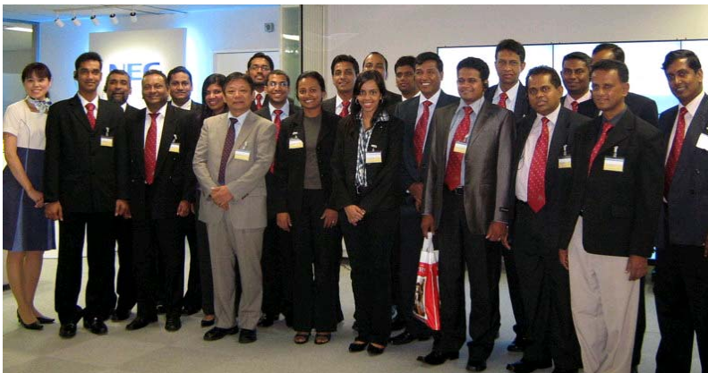
# 505 participants

efficiency study. #505 IT Business Strategy (Sept 26-30): 21 Sri Lankan people from IT sector including financial service watched and exchanged views with Japanese counterparts of ICT business for better use of the technology.