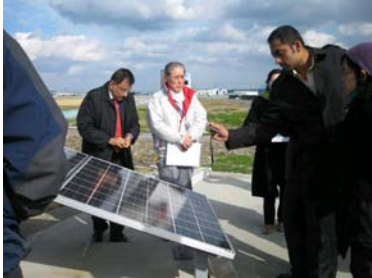
Visit our website for more details From study tour of #301

As usual, NGC offers you good chances to get to know the business connection in Japan of this field.